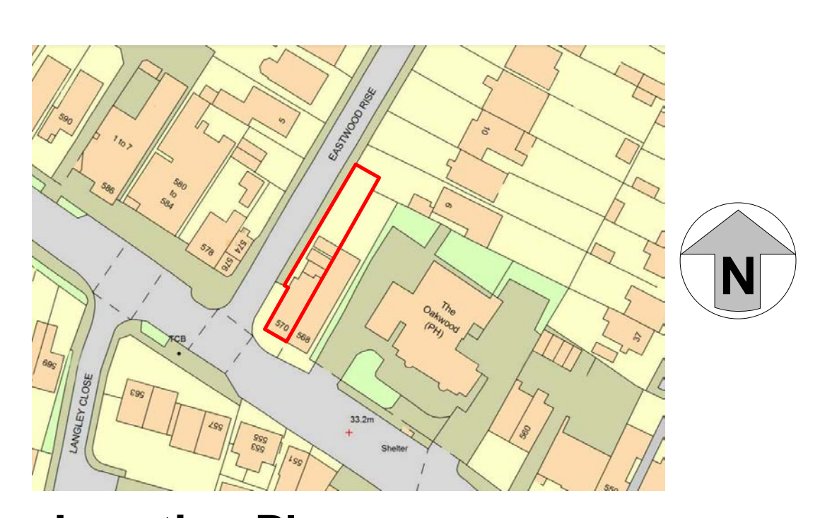
Location Plan 1: 1250